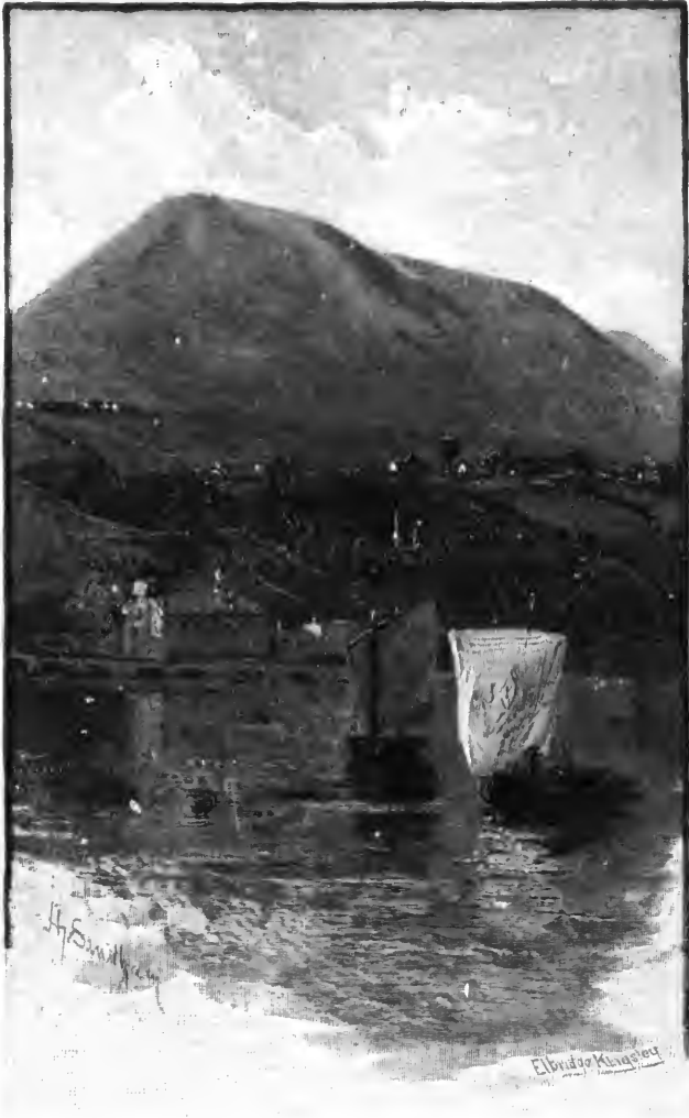
MOUNT STE. ANNE.

ago, on the site of a chapel erected in 1651. Looking to the left now, we see Montmorenci Falls, shining in the morning sun like a broad ribbon of molten silver, the dark shadows of the right bank casting long lines of gloom into the glen. As we pass the falls, we are wedging in between Orleans on the right, and gaps and grooves on the main-land to the left, eaten by ice and rains. Zigzag foot-paths run up to the hill-tops from the river and road-side; narrow strips of land, fenced into all sorts of geometrical figures, straggle up over the hills into the horizon; clumps of pines are seen along the shore; and above and about the trees are the picturesque white farm-houses, with their gray, and red